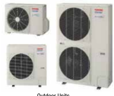
Outdoor Units RAV*AT