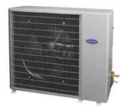
Outdoor Units 24AHA4 25HHA4