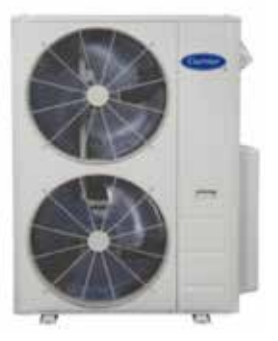
Outdoor Unit 38MGR 36/48K